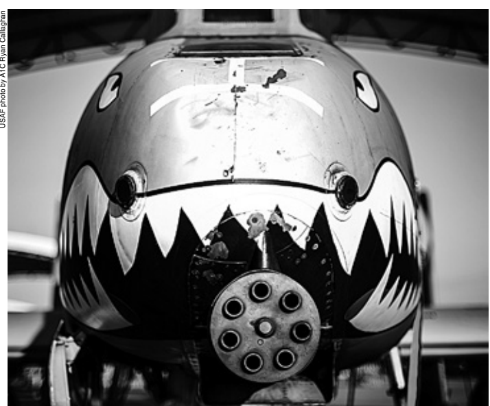
An A-10 Warthog under a sun shade at Moody AFB, Ga.